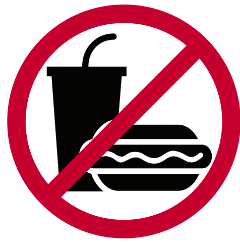
OUTSIDE FOOD OR DRINKS