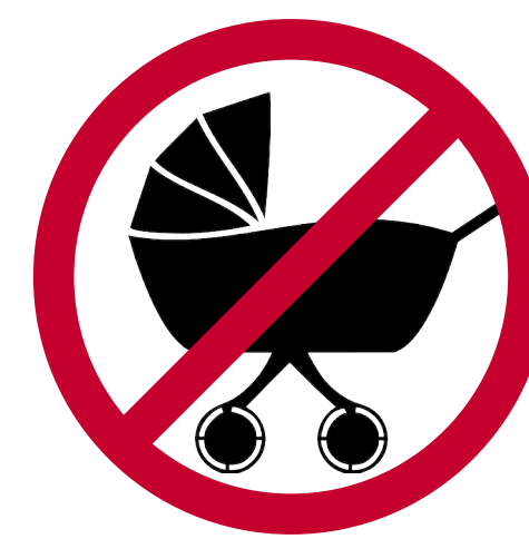
STROLLERS/ CAR SEATS