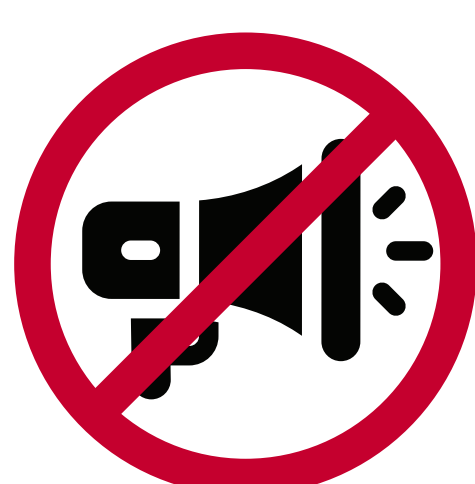
ARTIFICIAL NOISE MAKERS