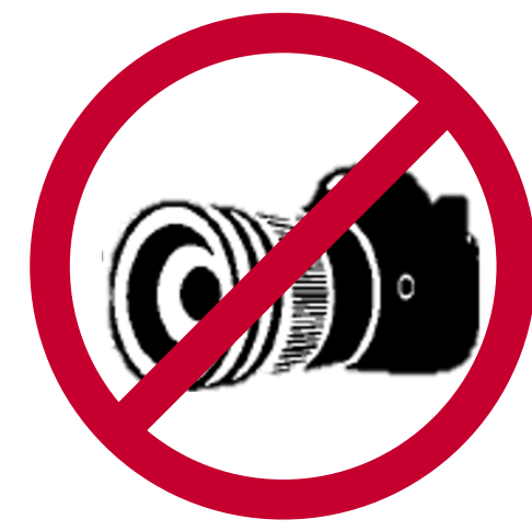
PROFESSIONAL CAMERA/VIDEO EQUIPMENT