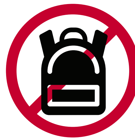
BAGS OR PURSES